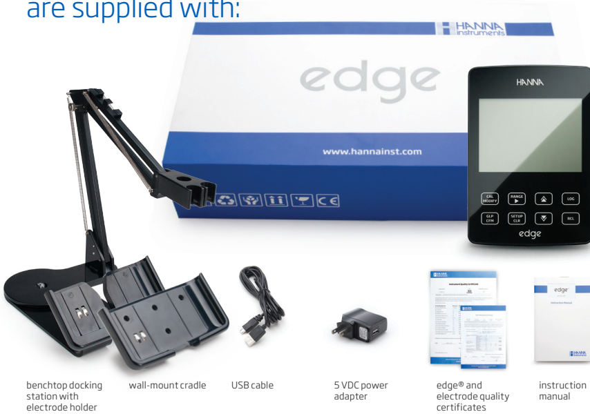
benchtop docking station with electrode holder

All edge® single parameter meters are supplied with: