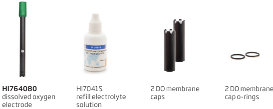
HI764080 dissolved oxygen electrode

edge® DO kit: HI2040-01 (115V) and HI2040-02 (230V) also includes: