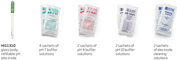
HI11310 glass body, refillable pH electrode

edge® pH kit: HI2020-01 (115V) and HI2020-02 (230V) also includes: