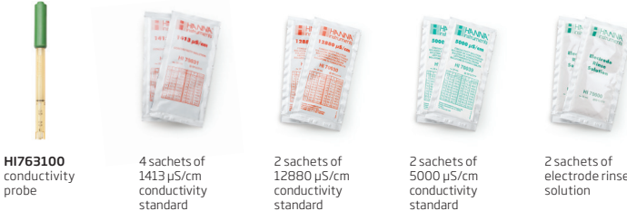
HI763100 conductivity probe

edge® EC kit: HI2030-01 (115V) and HI2030-02 (230V) also includes: