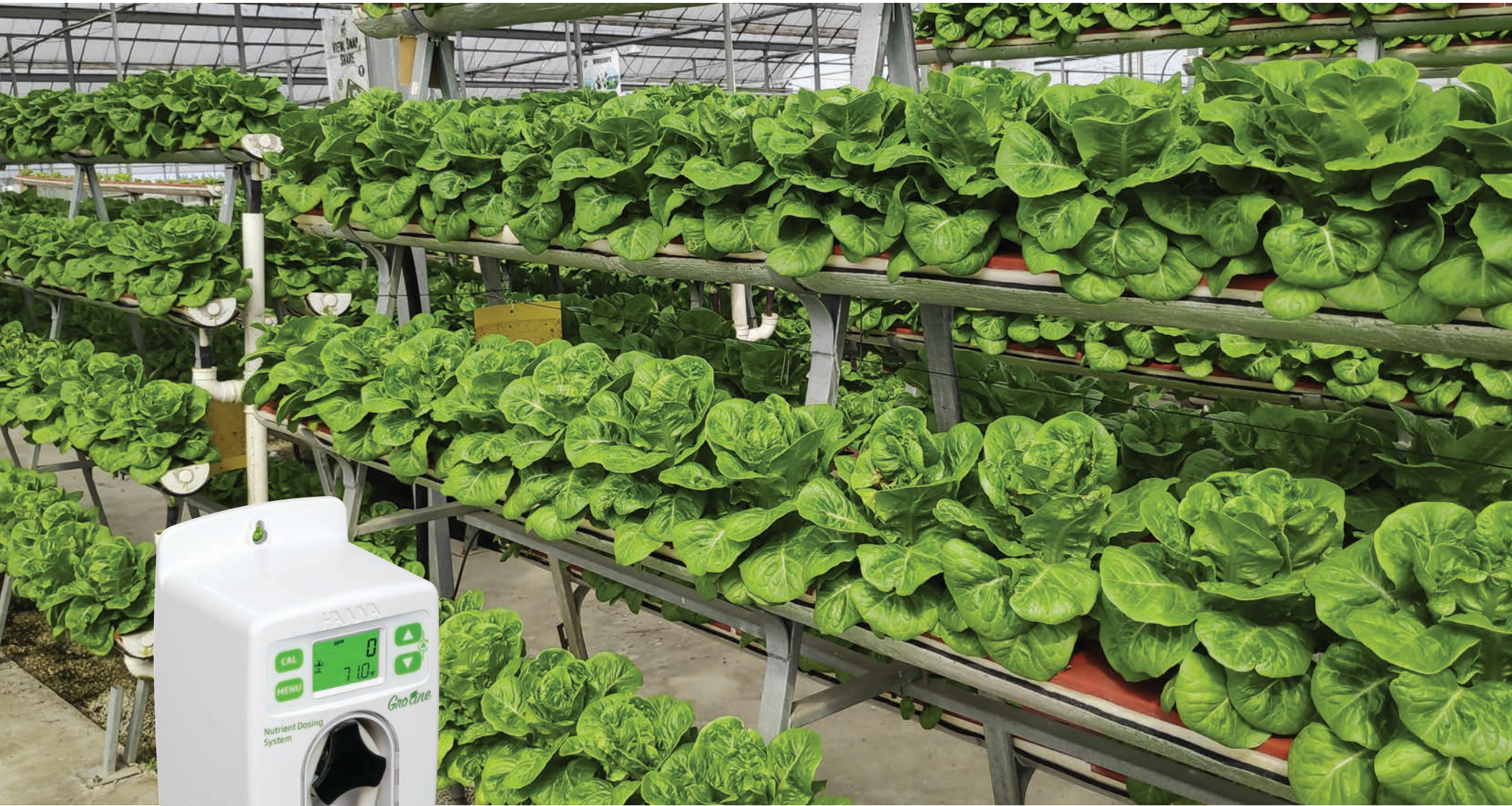
HI981413 Nutrient Dosing System