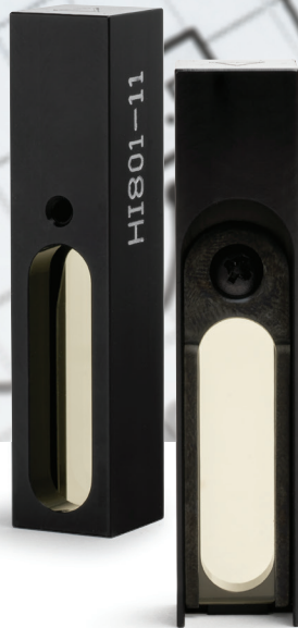
HI801-11 Holmium Filter