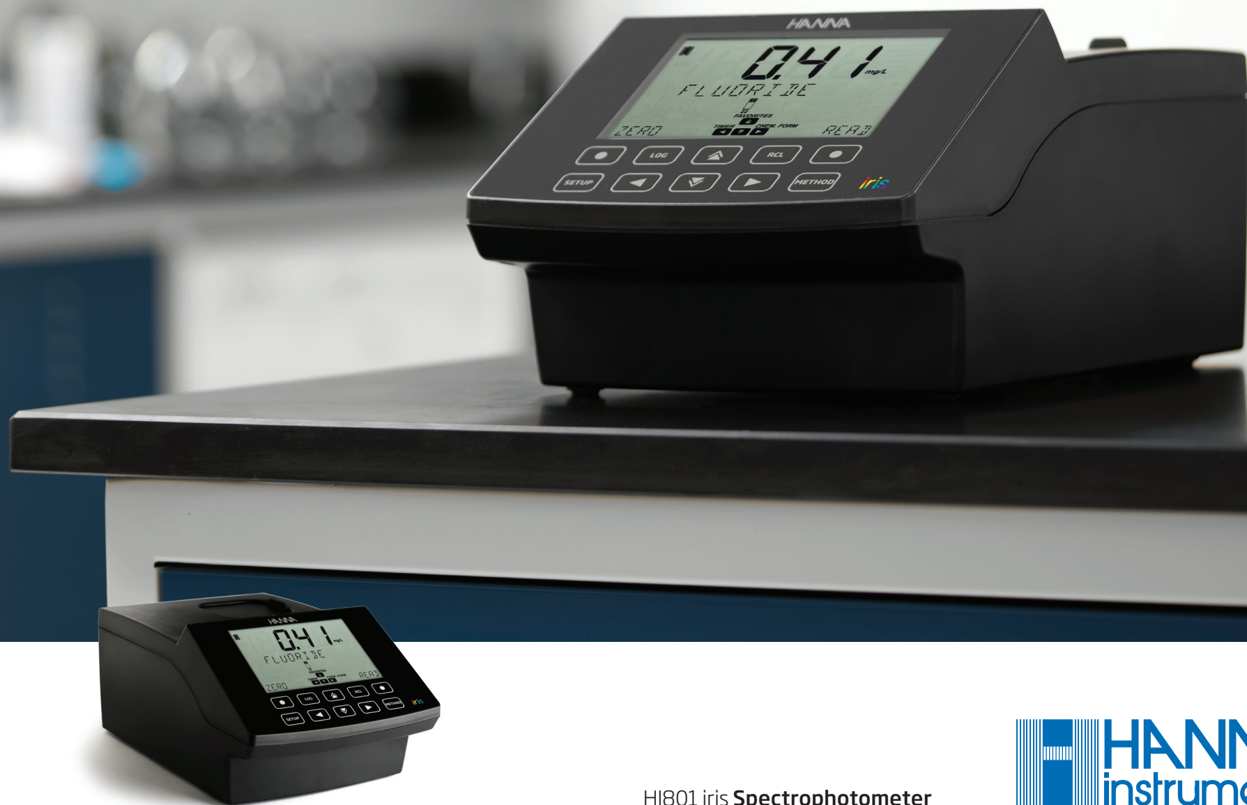
HI801 iris Spectrophotometer